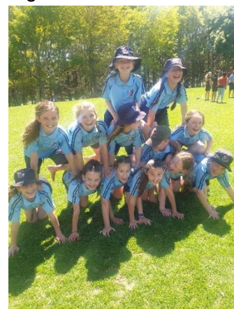
Year 5 & 6 Girls Ravens Team Pyramid