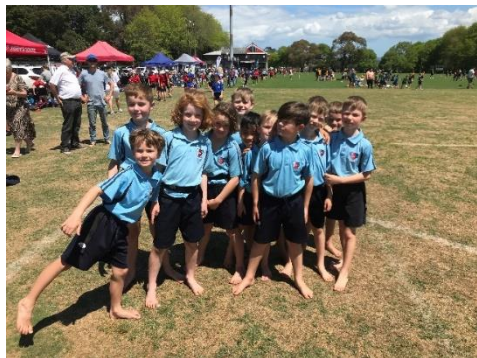
Year 3 Boys Titans Team After their win.