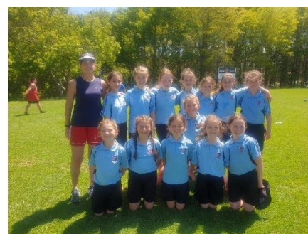
Year 5 & 6 Girls Ravens Team