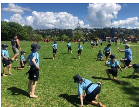
Year 3/4 Mixed Jets Team Warming Up