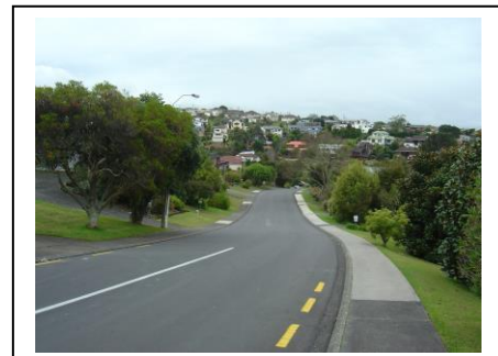
St. Ives Terrace

Children are not allowed in the carparks unless accompanied by an adult.