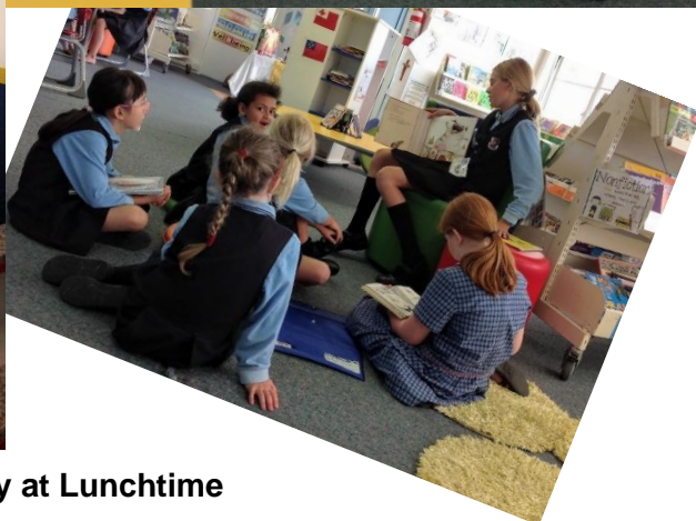
Student Librarians as Storytellers and the Library at Lunchtime