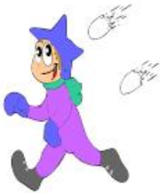
$ 65 Full day

For further information contact Barb Tel: 027 440 6363 or 09 478 3705