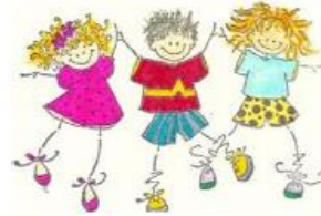
$ 60 Full day

11th July—22nd July 2022 Open 7am til 6pm Monday to Friday