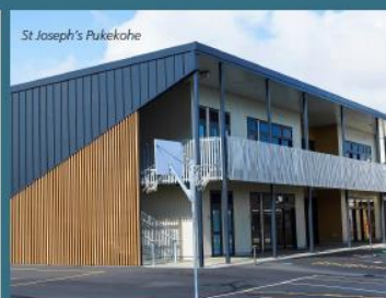
St Joseph's Pukekohe