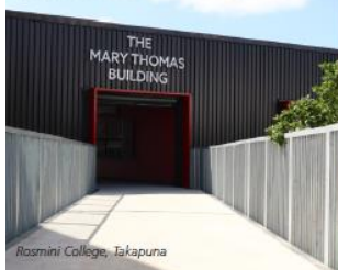
Rosmini College, Takapuna

Providing for Catholic Schools in the Auckland Diocese