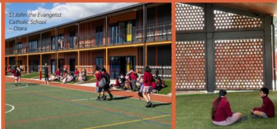
St John the Evangelist Catholic School – Otara